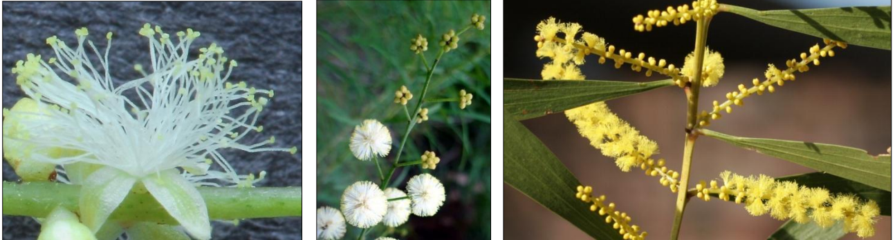
A flower showing the petals

The flowers of acacias are very small and coloured pale cream to golden. They can provide an impressive display, because many flowers can be clustered together in either globe-shaped heads (up to 130), or cylindrical-shaped spikes (up to 500).