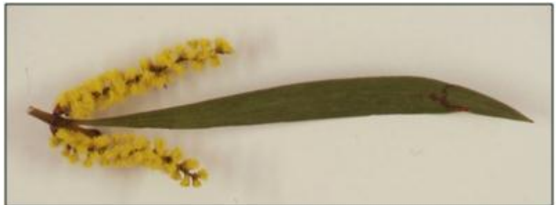
Sydney Golden Wattle

Acacia longissima ( sp , very long-leaved)