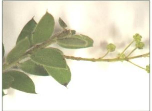
Hairy Wattle, Weeping Boree