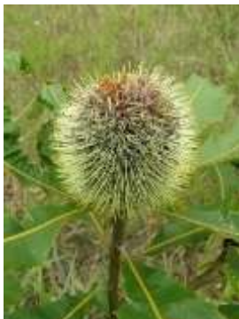
B. robur spike

Spreading or erect shrub, 1-2m tall with single or several grey/brown stems arising from a lignotuber. Leaves are very large, dark green with sharply serrated margins and a raised midvein especially on the light green underside, which may also have rusty felt-like hairs. Flowers January to July; spikes up to 12cm long; blue/green flowers turn yellow/brown with age. Scattered distribution both north and south of Sydney, along creek lines or hanging swamps in