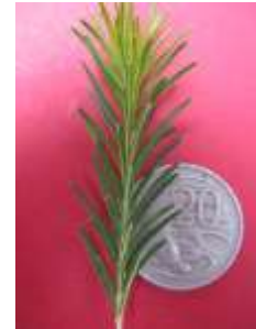
B. ericifolia flower spike.

Bushy shrub or small tree to about 6 m tall. Small crowded narrow leaves, margins curved under, apex has 2 small teeth; light green when young. Attractive orange-red flower spikes to 20 cm with hooked styles, produce copious amounts of nectar, attracting birds, insects and small mammals. April-August flowering. Solid, woody seed cones follow. Grows in heath and woodland in sandy coastal areas and Sydney district plateaux.