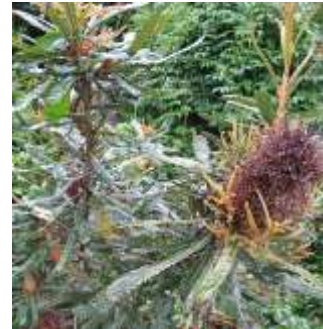
B. aemula shrub in KWG

As the name suggests, B. aemula is very similar to B. serrata . However its leaves are generally narrower. The best identifier is its stigma, which is only about 1mm long whilst that of B. serrata is 2-3mm long. B. aemula grows in the coastal area north from La Perouse and also at Agnes Banks. Flowers February to June.