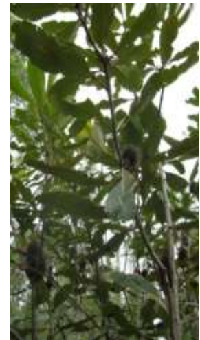
B. robur growing naturally in Pindar Brook floodway 200m above Hawkesbury River

moist sandy or peaty soils. However B. robur can tolerate a range of conditions under cultivation.