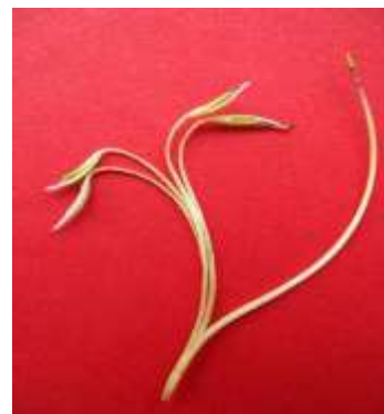
An individual flower