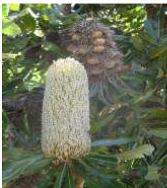
Spike of Banksia flowers & woody seed follicles

Banksias are plants with woody stems ranging from trees to prostrate shrubs. Their leaves are leathery and often rigid. The underside of the leaves are paler than the upper. The flower spikes are conspicuous and contain between 100 to 6000 individual flowers. The flower consists of a single style and four stamens attached to the perianth segment. Normally only a small proportion of the flowers will produce the woody seed follicles embedded transversely on a central woody cone. These follicles take a year or two to mature and may, depending upon the species, stay on the plant for many years awaiting the heat of bushfire or even the death of the plant. Two winged seeds are released from each follicle when they are opened.